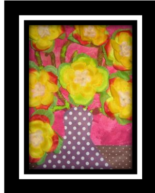
Artist - Ramon Quennell

The Room 5 Artists had to consider cutting techniques when cutting out the vase, being careful not to cut the line of symmetry, the placement of the vase and the table cloth, the painting of the stems using green dye, how the textured background was created using paint and the placement of the synthetic flowers to complete the visual art works.