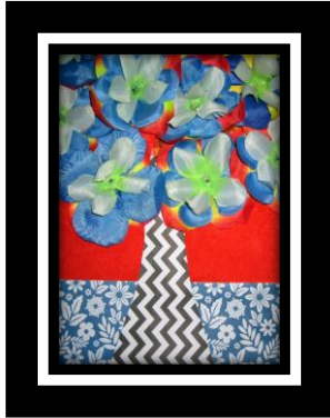
Artist - Laurel Dondlinger

The process involved making a symmetrical shape, (the vase) placed on a table cloth, completing the textured background and arranging the stems and flowers within the vase.